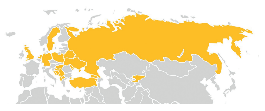
Pilot Project 4: "Quality and Training in the Asylum Processes: The European Asylum Curriculum"<sup>35</sup> (PP4), is led by Sweden (Swedish Migration Board) with the support of Germany (Federal Office for Migration and Refugees) in close cooperation with the EASO and UNHCR. EASO has an active role in the design of the project.

The Prague Process Action Plan 2012-2016, adopted at the "Building Migration Partnerships in Action" Ministerial Conference in Poznan on 4th November 2011, outlines 22 specific activities in 6 thematic areas to be implemented during this period. The preparatory meetings for the Action Plan resulted in extending the thematic scope of the Process's agenda to include the area of asylum and international protection, which evolved into an independent area of further cooperation. From August 2012 to January 2016, Poland and six other leading states are implementing the EU-funded initiative "Support for the Implementation of the Prague Process and its Action Plan", also known as the "Prague Process Targeted Initiative" (PP TI). The initiative is led by Poland together with the Czech Republic, Germany, Hungary, Romania, Slovakia and Sweden, who also take the lead in the PP TI pilot projects.