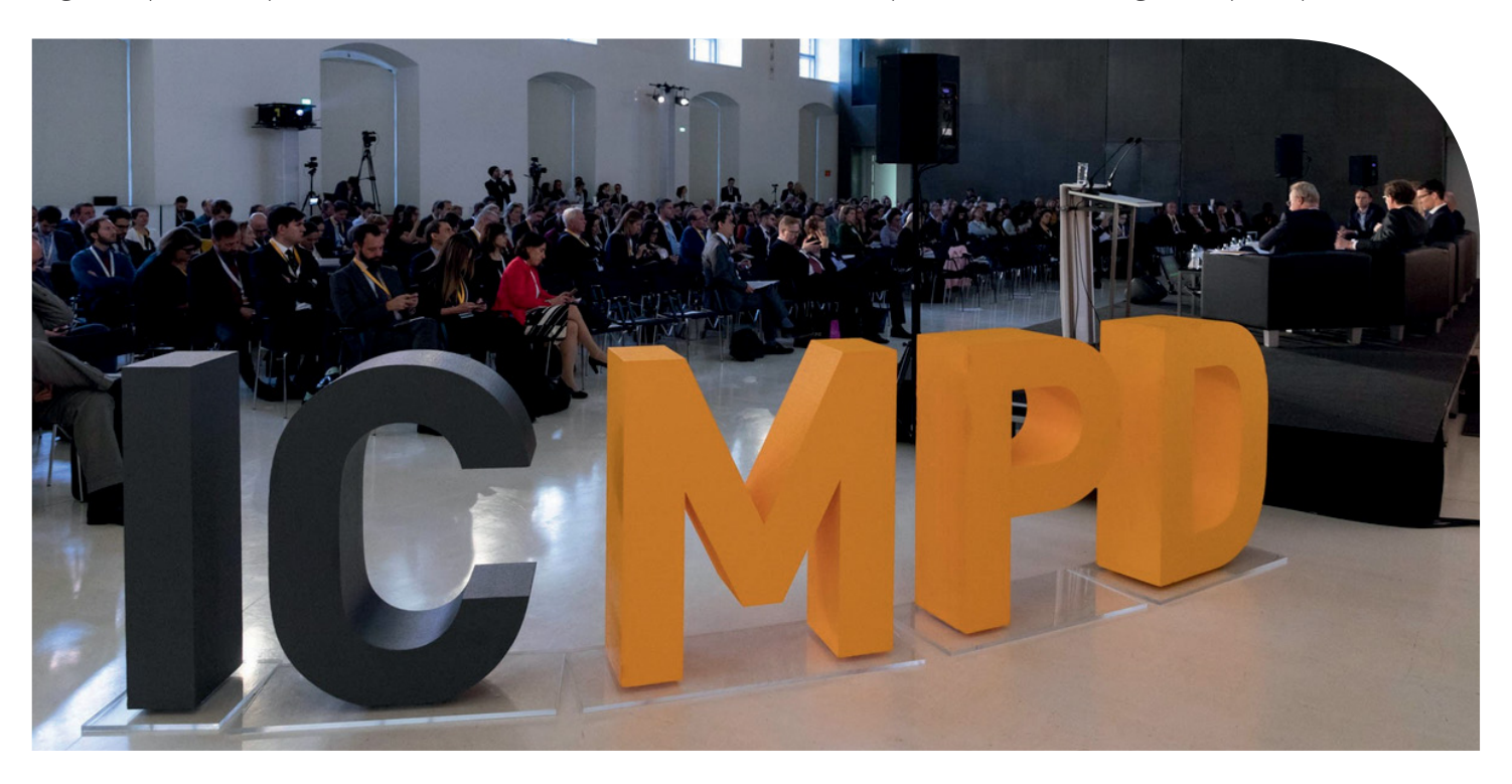
Further information: Website of the Vienna Migration Conference, Photo gallery, Download 70 Recommendations

with the diversity of ICMPD's migration expertise The Vienna Migration Conference has become a significant platform for continuous informal and open dialogue between different actors in the migration sphere, which confirms, among others, record number of visitors, high-level participants.