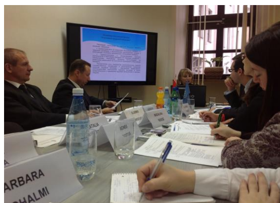
PP2 Expert Mission to the Republic of Belarus 2013